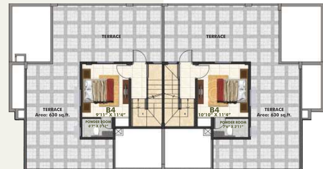
TYPE - B