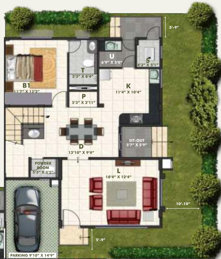
TYPE - B