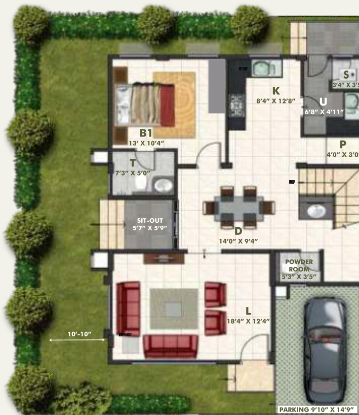
TYPE - A